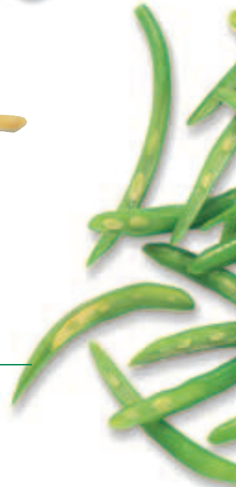
Sliced green beans

Whole green beans extra fine Whole green beans very fine Whole green beans fine Whole green beans medium