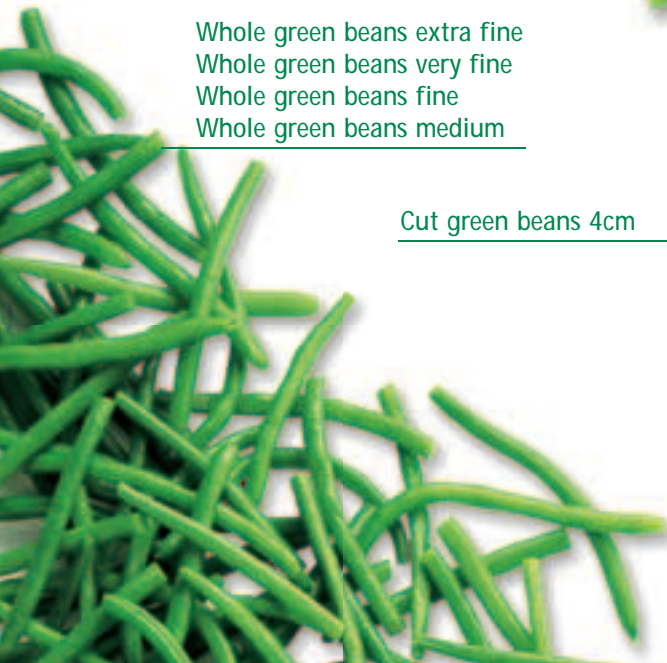
Cut green beans 4cm

Whole green beans extra fine Whole green beans very fine Whole green beans fine Whole green beans medium