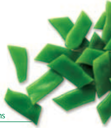
Cut Romano beans