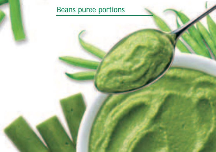
Beans puree portions