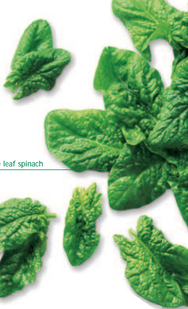
Loose leaf spinach