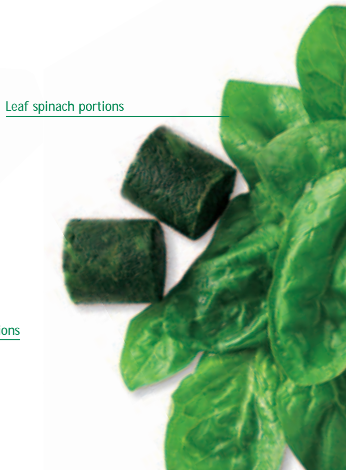
Leaf spinach portions