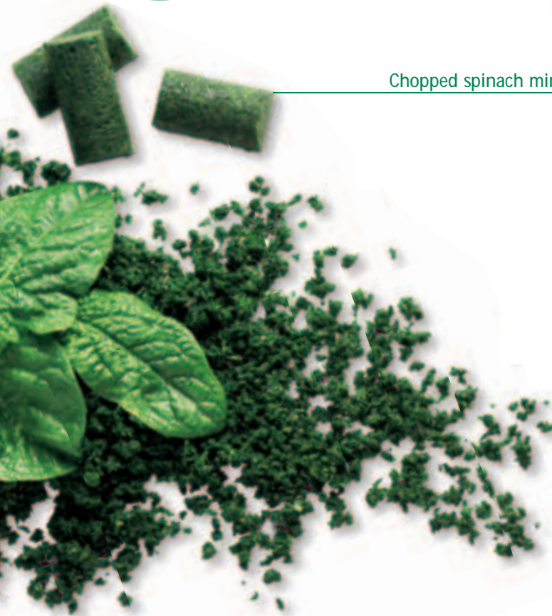
Chopped spinach mini-tablets