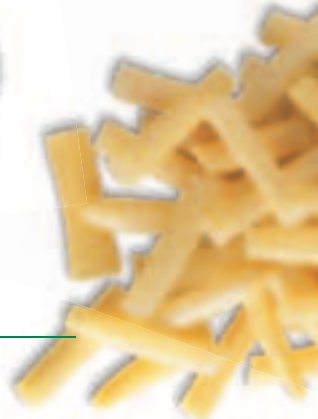
Black salsify Black salsify extra