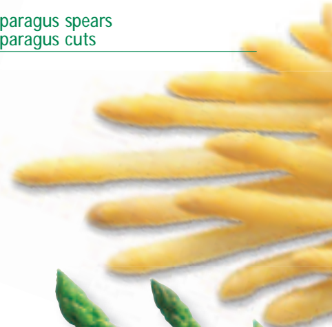
White asparagus spears White asparagus cuts