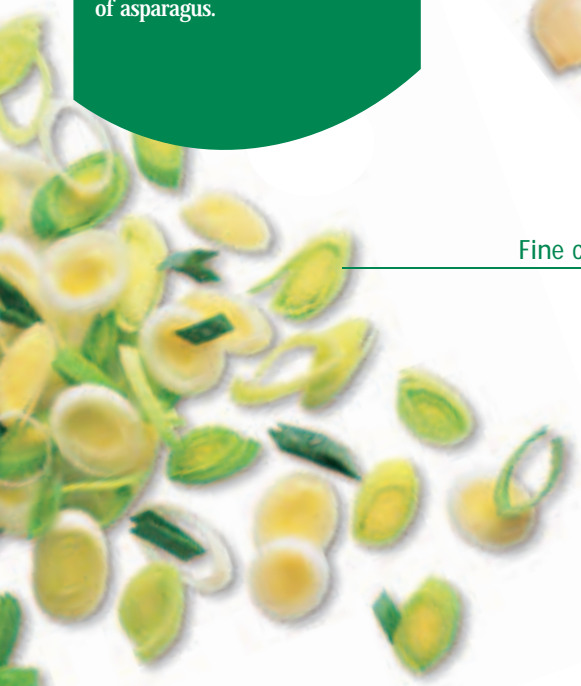
Fine cut leeks